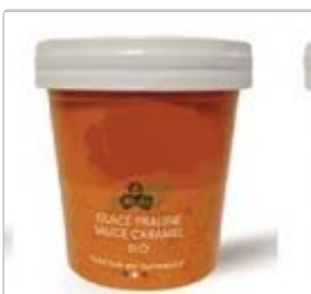
Full range of sorbets (frozen)