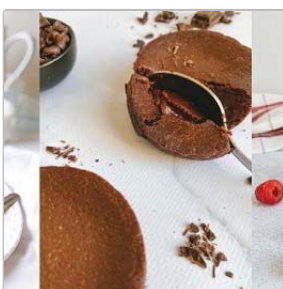
3 fresh individual desserts : lemon pie / chocolate