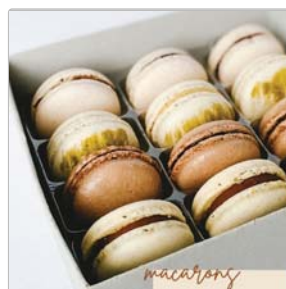
Macaroons box (frozen)