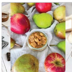
3 fresh individual desserts : chocolate pie / apple-pear crumble / plum flan